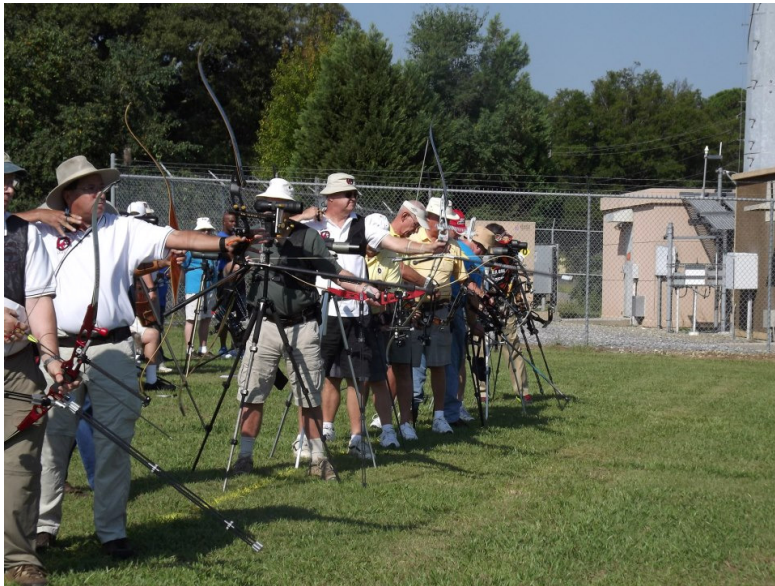
Archery Competition-2012 Georgia Golden Olympics